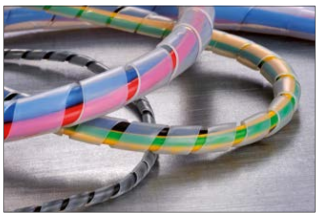
Spiral binding SBTFE - ideal for extreme conditions.