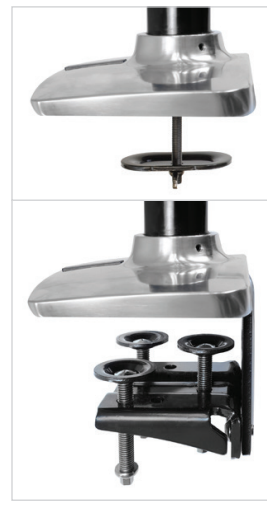
DESK CLAMP ATTACHES TO EDGE UP TO 2.5" (65 MM) THICK