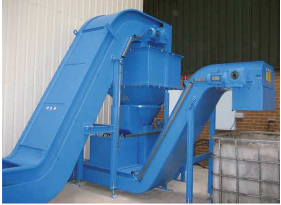
Swarf processing system with VBU centrifuge and swarf crusher

At the same time, dry swarf can be sold at a higher price.