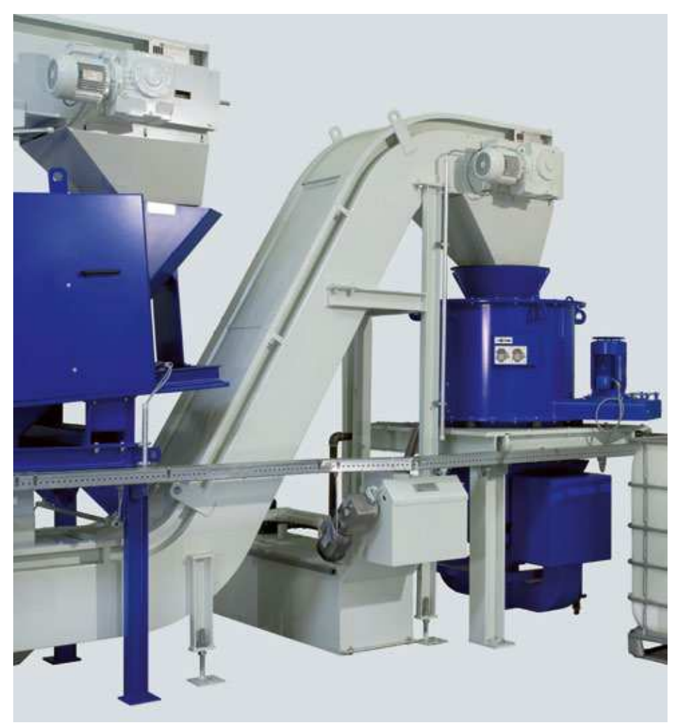
Swarf processing: individually designed to the requirements of the manufacturing process

This makes significant cost savings possible, for example due to saved oil.