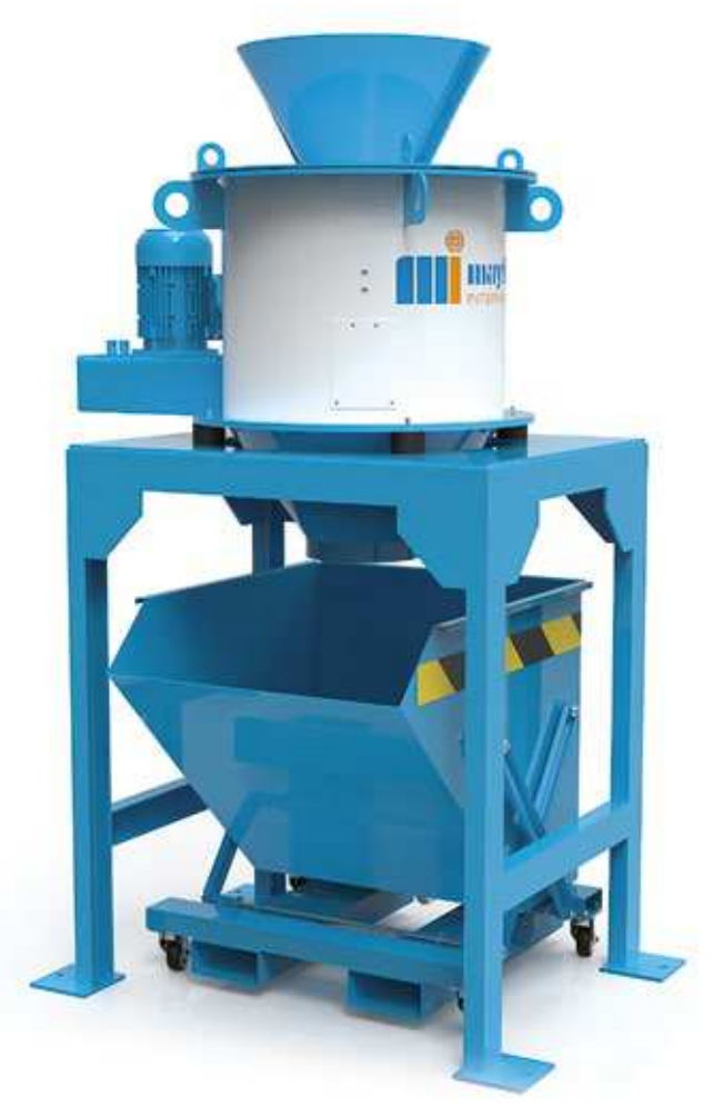
VBU swarf centrifuge are available in six different sizes

The accelerated swarf passes over the upper edge of the drum and is conducted through the centrifuge housing and the discharge hopper to a swarf container or discharge conveyor.