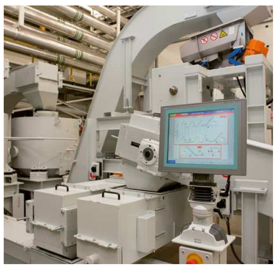
VBU swarf centrifuge for continuous use