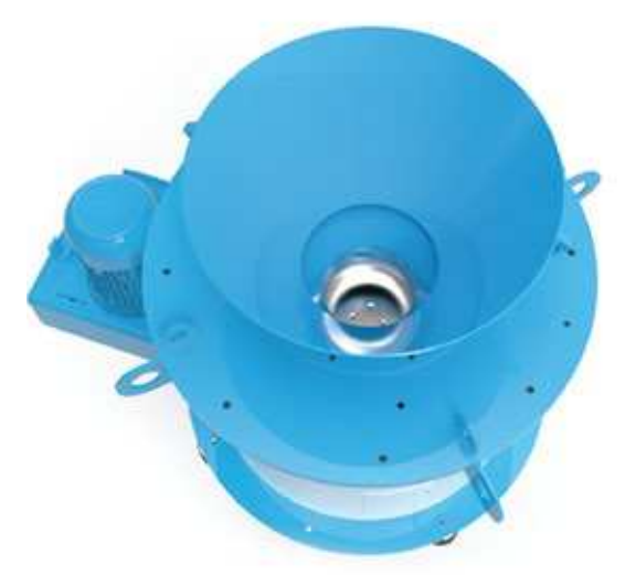
Large hopper, ideal for fully automatic operation