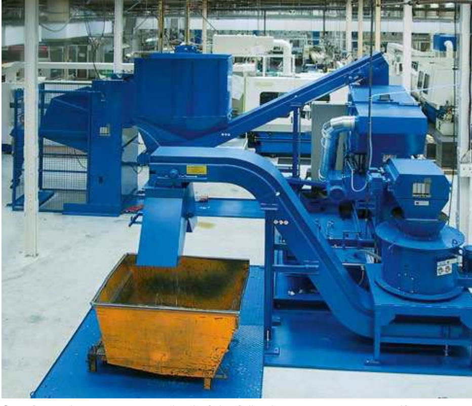
Swarf pressing system comprised of the following components: centrifuge, swarf crusher, conveyor and container loading