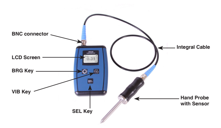
Figure 1. The VBA20