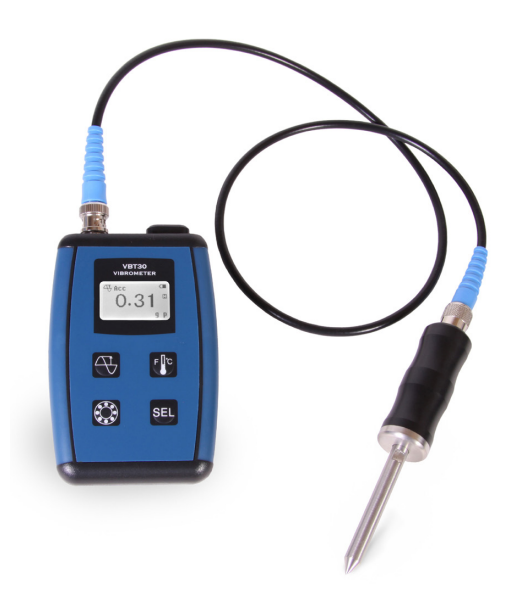
HS-620/630 Monitoring Kits