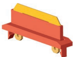
50A / 100A Collector Shoe and Holder 310993